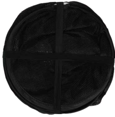
Herb Drying Rack 1 pc.