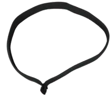
Strap 2 pcs.